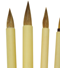
LBAM-1 bamboo series B upc: 090672093622