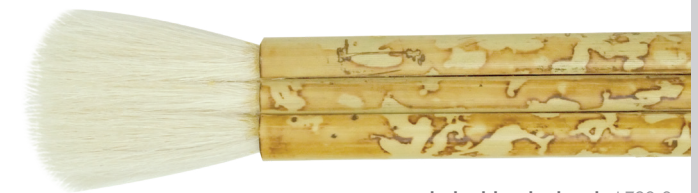
hake blender brush L790-3