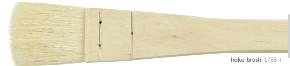
hake brush L788-1