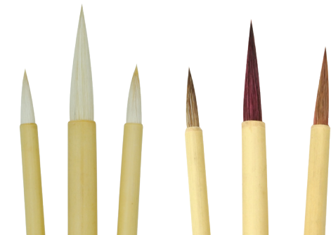
LBAM-2 bamboo series JW upc: 090672095657