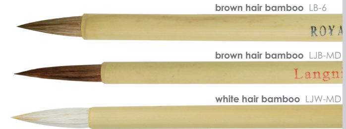
brown hair bamboo LB-6